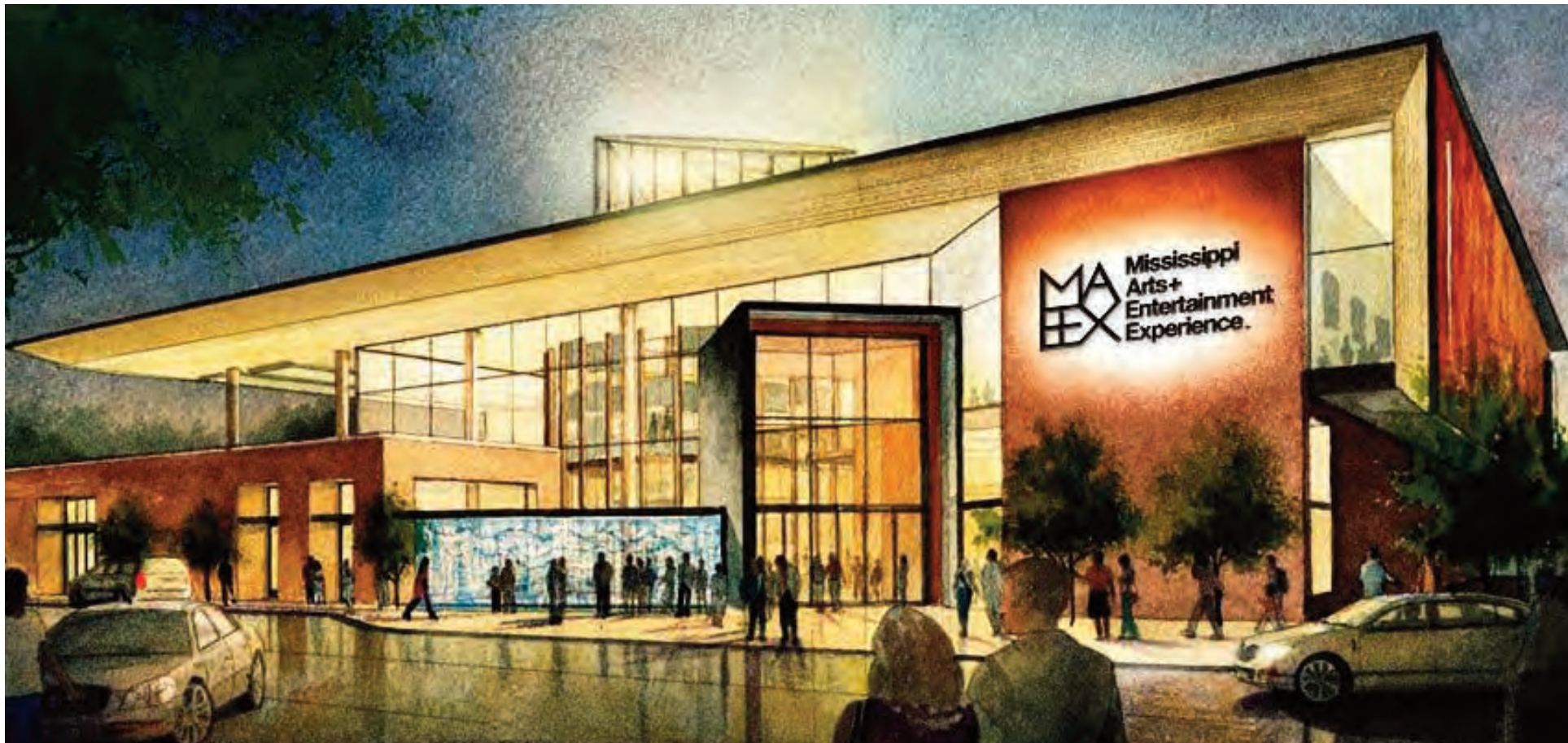
Yates constructed the MAX in Meridian.

W. G. Yates & Sons Construction Company (Yates Construction) is part of The Yates Companies, Inc. who ranks among the top construction services providers in the nation. Committed to maintain its headquarters in Philadelphia, Mississippi, the company is in its 55th