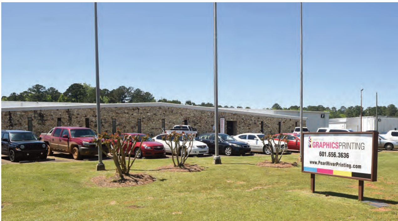
Pearl River Graphics Printing